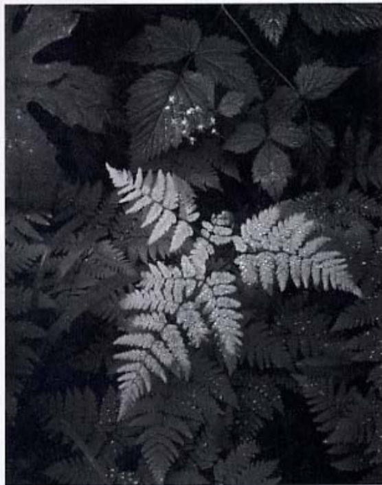
L eaves, Mount Rainier National Park, Washington, c. 1942