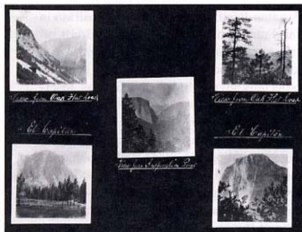
Album page of Ansel Adams's first photographs, Yosemite National Park, 1916

He created his photos carefully, as though they were paintings like those he'd seen at the Expo. Early in the twentieth century, photography was not considered a creative art, but Ansel hoped to change that. He'd seen how the use of light and shadow in paintings could bring them to life, and he wanted to use his camera to paint with light. He visualized the story he wanted to tell with each photo. "The picture we make is never made for us alone," he said later.